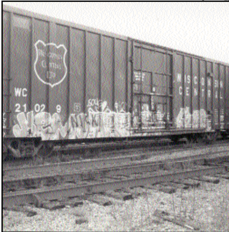
Graffiti is commonly found in transportation systems, such as on the side of this railroad car.

Graffiti tends to recur in some locations. In fact, areas where graffiti has been painted over—especially with contrasting colors—may be a magnet to be revandalized. § Some offenders are highly tenacious—conducting a psychological battle with authorities or owners for their claim over an area or specific location. Such tenacity appears to be related to an escalating defiance of authority.